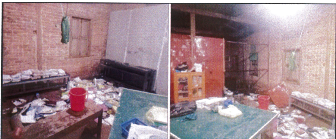
Damages of the school furniture of the Basic Education Sub-High School in Shwegyin Township in the aftermath of arson attacks of PDF terrorists