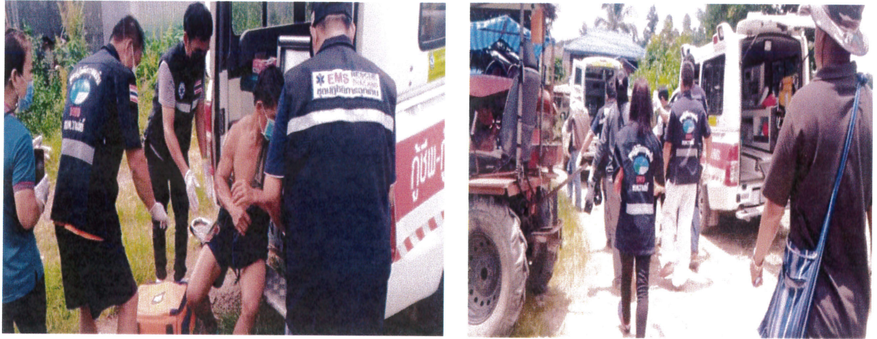
The location of KLNA/ PDF team who were injured and received medical treatment