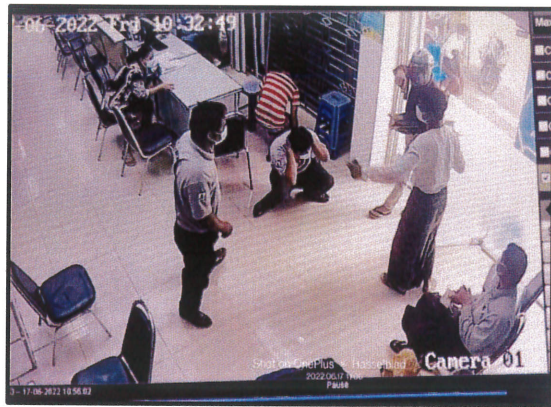
PDFs Terrorist who robbed at the KBZ Bank Branch(9), Chan Aye Tharzan Township, Mandalay Region (17-6-2022)