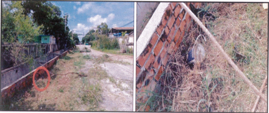
An IED planted by terrorists found near the drainage outside the brick wall at the back side of No (27) Basic Education High School in the ward (I) of Pyigyitagon township

Security forces are reportedly carrying out necessary investigations to identify and arrest those who were involved in the heinous crimes and take punitive legal action against them. The entire national people were urged to oppose terrorist groups and participate in protecting security for the future of children by giving reports about movements of terrorists to concerned administrative bodies, it is reported.