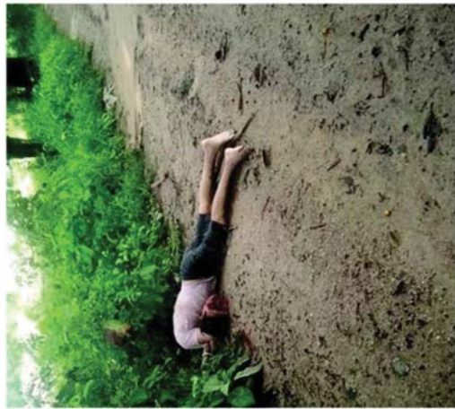
Figure C8. A 74-year-old retiree beheaded by the PDF