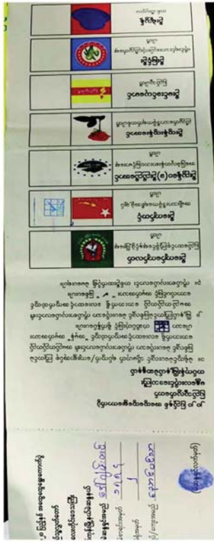
Figure A9. Fraudulent advance ballot papers pre-stamped with the vote for NLD