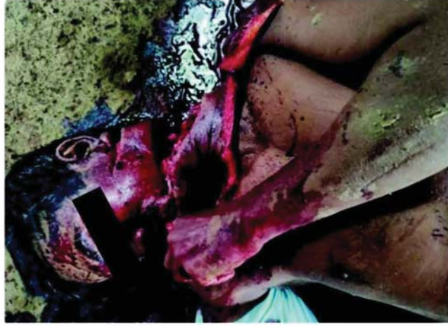
Figure C5. A community leader / elected village administrator killed by the PDF

22 July 2021, 23:30, Thadut Village 7, Myaing Township, Magway Region: Around 30 men entered the house of elected village administrator U San Aung (52 years), and stabbed and hacked him to death. Two sons were injured. They and the remaining family fled into the woods near the village. The tasks of a village administrator include development work for the village, such as road construction, school rehabilitation and welfare activities. Village administrators are elected by the community, one vote per household, and are not civil servants. They receive a nominal sum for operating expenses, such as transportation costs to township level on behalf of the village.