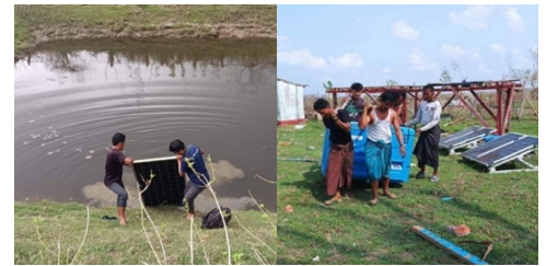
Solar Vaccine Refrigerators have been restored

As soon as channels of communication are facilitated, the Ministry of Health quickly assessed the situation of the damaged health centers. According to reports, a total of 507 hospitals, health facilities, offices, training centers and related buildings were damaged. After the cyclone, the Ministry of Health has begun to rebuild and repair the damaged buildings. A substantial fraction of the damaged buildings have been repaired using maintenance fund of the Ministry of Health. The Ministry has developed the repair, maintenance and reconstruction plans and agreed with the Ministry of Construction for the mentioned tasks to be accomplished. The necessary supplies such as corrugated iron sheets, nails, and cements have been provided under the arrangement of national disaster management committee, the ministry and local government. With the continuous effort, majority of the repair jobs in most of the townships has been accomplished. Consequently, the MoH has resumed patients care in health facilities and training functions in nursing and midwifery school within weeks.