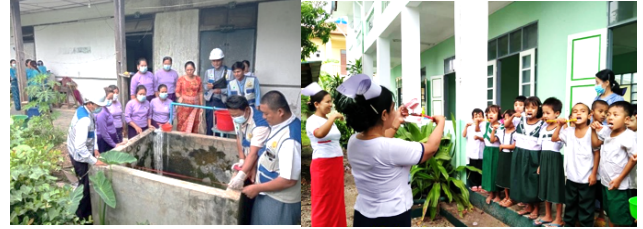
School Health Activities