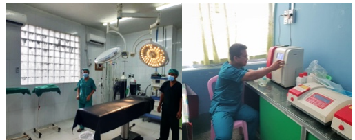
OT and Laboratories are functioning