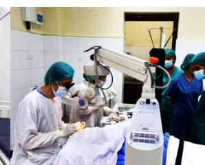
Renal Dialysis and Eye Surgery are performing in Sittwe Hospital