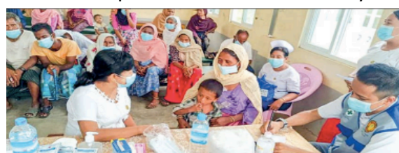
Mobile Clinic provide Medical Care to the community