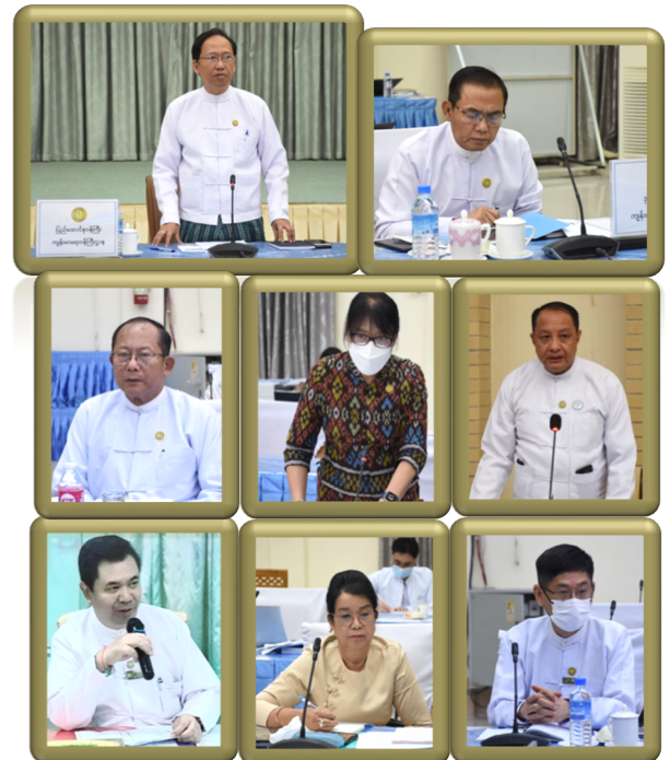
Union Minister for Health , Deputy Minister and Director Generals in Post-Cyclone response meeting

Following the disaster, the Ministry of Health scheduled a virtual coordination meeting on 30th May, 2023. Professor Thet Khine Win, the Union Minister for Health, directed the provision of high-quality medical services better than those were available prior to the event. Additionally, he urged strongly that the damaged hospitals and health facilities to be repaired before the rainy season. The Union Minister also stated that the activities in Rakhine State are carried out under the guidance the National Disaster Management Committee, which is centrally led by Vice Senior General Soe Win, Deputy Prime Minister. In Rakhine State the rehabilitation activities have been conducted under the guidance of Deputy Prime Minister Admiral Tin Aung San.