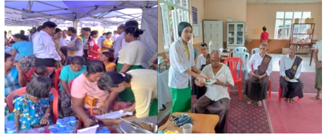
Traditional Medicine Hospital Team provides Care to the community

All departments under Ministry of Health have collaborated and synergized their efforts to deliver necessary health care services for the community. The Department of Traditional Medicine in Sittwe has provided the treatment to in patients and out patients at its 50-bedded traditional medicine hospital. Moreover, patients can receive medical treatment at their mobile clinic. The traditional medicine hospital has been carried out its proper functions since the cyclone ceased. The Department of Human Resources for Health has despatched medical teams from hospital under its department. The specialists from various medical universities have been providing health care in all the townships in Rakhine State.