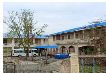
Nursing and Midwifery School in Sittwe after repair