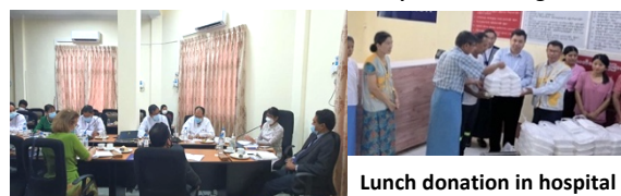
Lunch donation in hospital