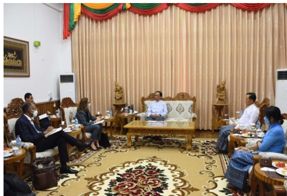
Union Minister for Health discuss with Rep. from UN Organizations