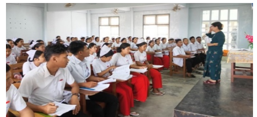
Training being resumed in Nursing and Midwifery School