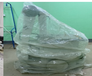
Renal Dialysis Machines ,Medicines and X Rays Machine were protected