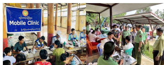
Mobile Clinic provide Medical Care to the community