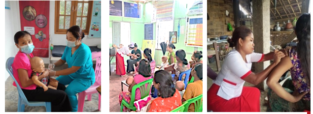
Routine, Catch Up and COVID-19 Immunization to Target Group