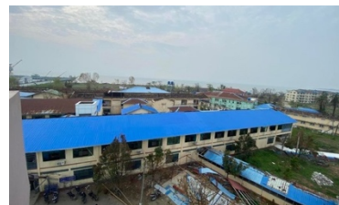
Obstetrics and Gynecology Ward in Sittwe General Hospital after repair