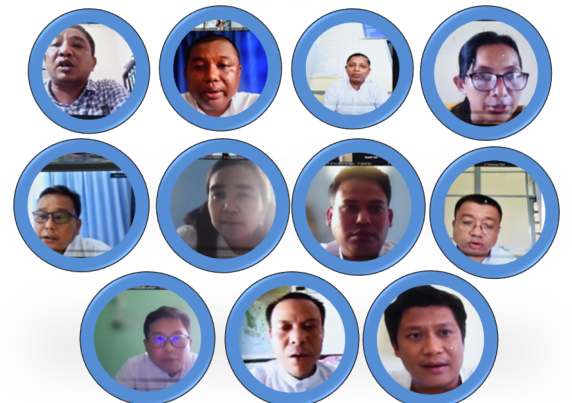
Township Medical Officers in Post Cyclone response meeting